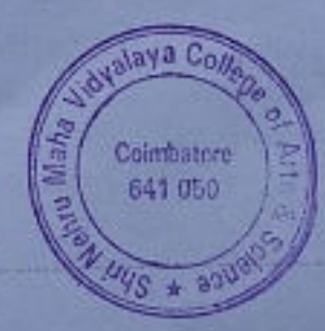
PRINCIPAL SHRI NEHRU MAHA VIDYALAVA COLLEGE OF ARTS & SCIENCE SHRI CAMBINIAL DAFILA NAGAR MALUMAGHAMPATTI COMDATORE - 641 059

Chairman- Academic and Administrative Audit Committee